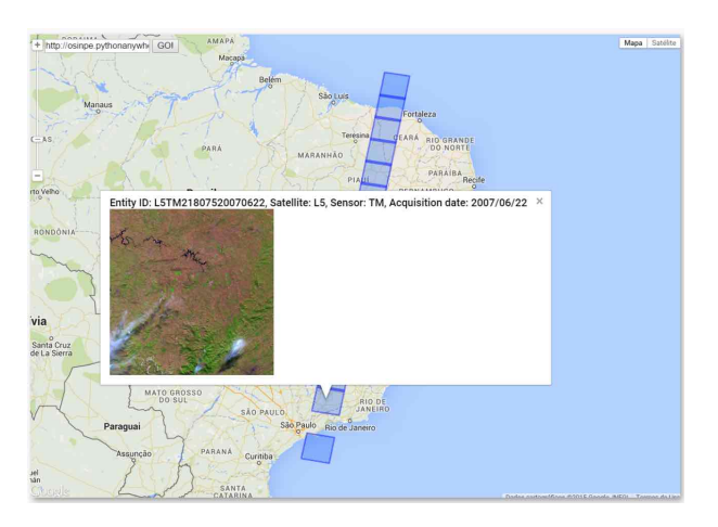
Figure 4: OpenSearch responses being displayed over the Google Maps API.

Figures 4 and 5 shows the OpenSearch responses in ATOM and GeoJSON formats being displayed in common frameworks used to produce maps on the web environment.