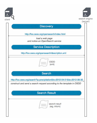
Figure 2: OpenSearch client-server interaction.

The OpenSearch Specification Description Document (OSDD) is the format to describe a search engine so that it can be used by search client applications. The OSDD exposes a template to the queries supported by the OpenSearch search mechanisms. Figure 2 shows the client interaction with an OpenSearch discovery server.