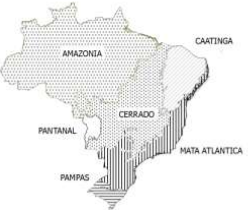
Figure 1. The six main biomes of Brazil according to the IBAMA classification.

The territory of Brazil was subdivided into different regions following the biome classification developed by Instituto Brasileiro do Meio Ambiente e dos Recursos Naturais Renováveis (IBAMA). The IBAMA classification includes six main biomes covering similar climatic and biological conditions; Cerrado, Amazônia, Caatinga, Pantanal, Mata Atlântica and Pampa (Figure 1).